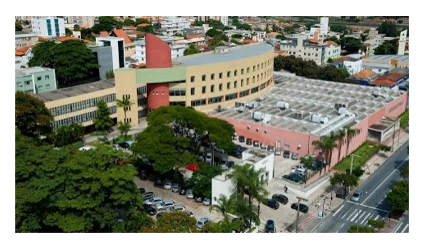
Campus I - CEFET-MG

The Federal Center for Technological Education of Minas Gerais has approximately 15,000 students and 650 teachers. It has a good reputation and a large number of departments and laboratories. It was founded in 1909 and has more than 10 campuses inside the Minas Gerais state.