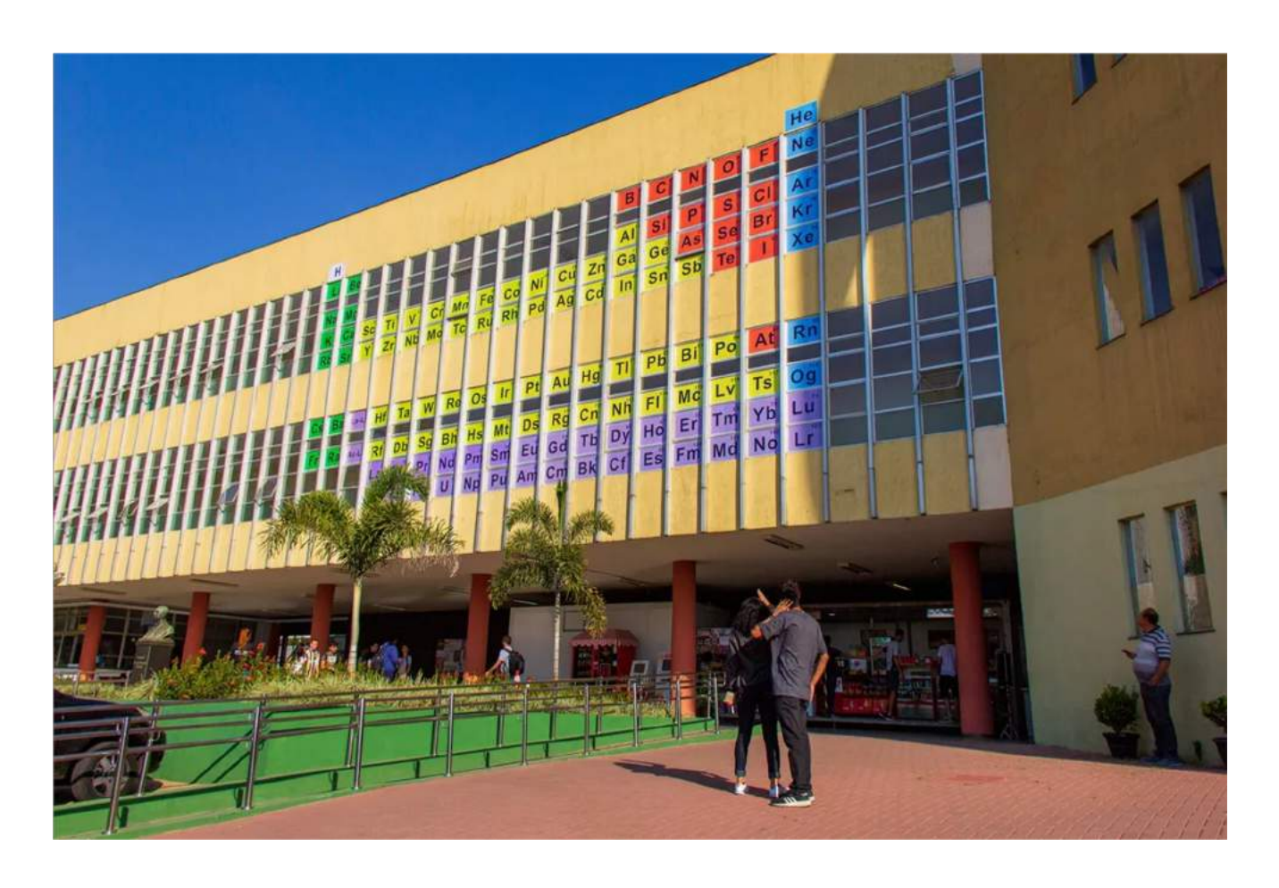
Chemistry Table Facade