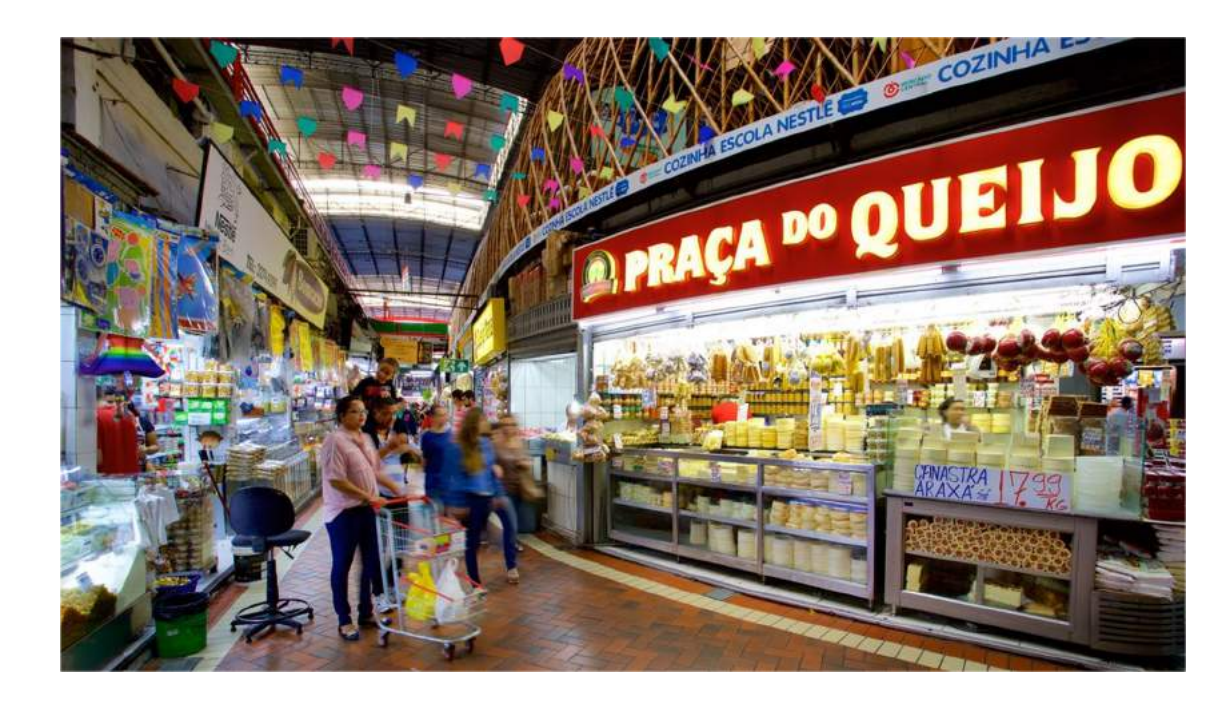
Mercado Central - Central Market