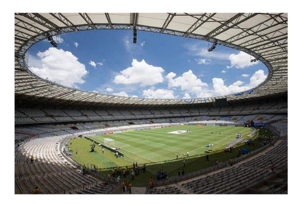
Mineirão (Soccer Stadium)