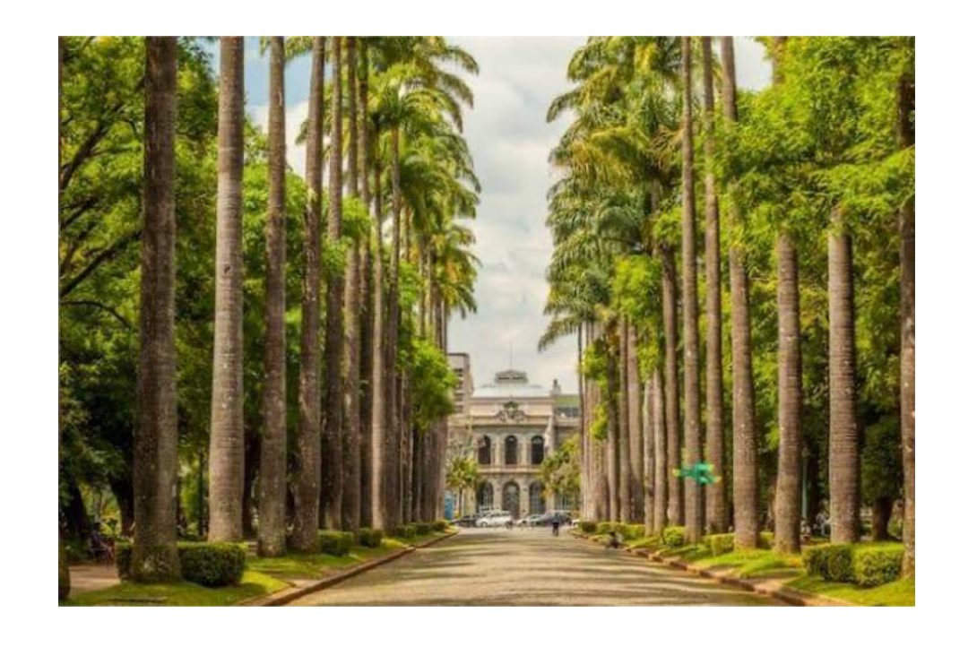
Praça da Liberdade - "Liberty Square"