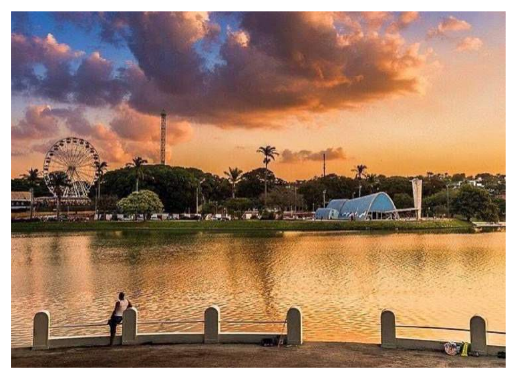
Belo Horizonte, Pampulha Lake