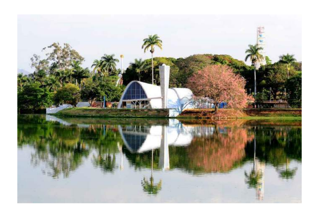
Church of São Francisco de Assis